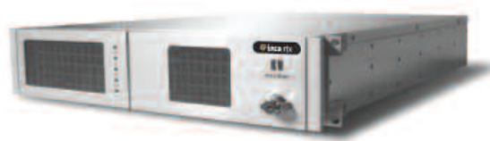
Inca CG 2U

Use C2i and A2i, Inscriber's conversion tool, to convert Chyron® and Aston® files to fully editable Inscriber layouts. Benefit from Inscriber innovation without losing your investment in a legacy system. Integrate C2i or A2i directly into Inca CG or run it as a stand-alone product. Evolving to the era of digital technology has never been easier.