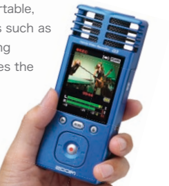
Q3 Handy Video Recorder

A handy video recorder that's compact and portable, the Q3 lets you enjoy video from special events such as concerts, recitals, weddings, class plays, sporting events- literally anywhere that great audio makes the moment memorable. The Q3 puts a little bit of video and a whole lot of audio together in one quick and easy to use camcorder that lets you produce great movies on the go!