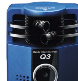
Q3 built-in mic image

The Q3 has two condenser mics on-board, engineered in the same X/Y pattern as the H4n Handy Recorder that gives recording pros the best stereo recording possible. Arranged with the right and left mics on the same axis, this design ensures that the mics are always an equal distance from the sound source for perfect localization without phase shifting. The result is a great sounding recording with natural depth and highly accurate stereo imaging every time... all at the touch of a button.