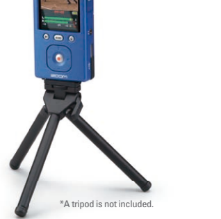
*A tripod is not included.

It's never been more important for journalists and bloggers to be versatile in the field. Shoot "on the scene" video, edit and upload with ease, all with broadcast-ready audio. And because the Q3 has a standard tripod mount, you can put it just about anywhere for the perfect shot in any environment.