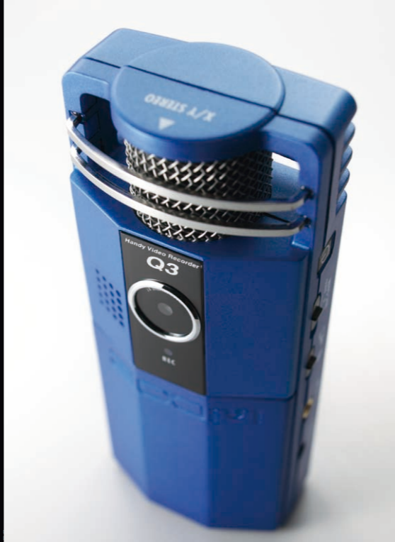
Handy Video Recorder Q3