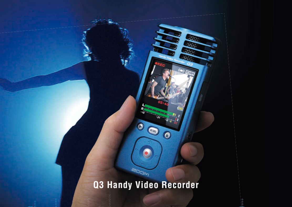
Q3 Handy Video Recorder