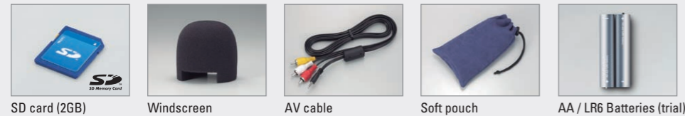
SD card (2GB) Windscreen AV cable Soft pouch AA / LR6 Batteries (trial)