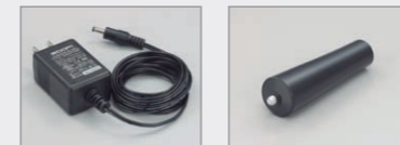
AC adaptor (AD-14) Mic clip adaptor