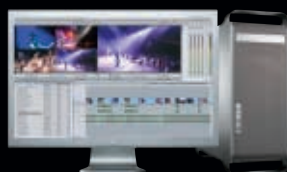
Apple Final Cut Pro 5 (Power Mac G5)