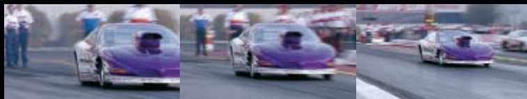
Higher-speed shooting at 25* to 60 fps lets you attain slow-motion effect. This is especially effective for high-action scenes such as car chases or crashes, or for scenes with great dramatic impact.