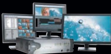
Avid Xpress Pro HD Avid NewsCutter family Avid Media Composer Adrenaline HD