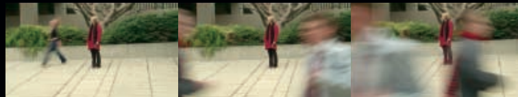
Lower-speed shooting at 4 to 23* fps lets you attain fast-motion effect. This technique can be combined with warp-speed effect, special emphasis to flowing water, fast-moving clouds.