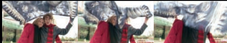
Normal cinematic shooting is done at 24 fps, the same rate as in film cameras.

The AG-HVX200 puts the film-like rendering capabilities that distinguish the VariCam into the hands of a wider range of users. For those already using VariCam, the AG-HVX200 can serve as an extremely mobile sub-camera that lets you explore entirely new shooting possibilities.