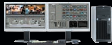
Canopus EDIUS HD/SD/SP/NX